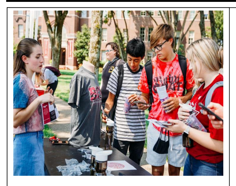
BCM Organization Fair