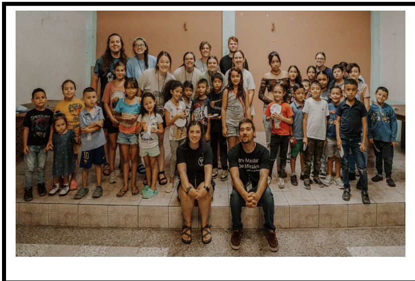
Costa Rica and Alaska!